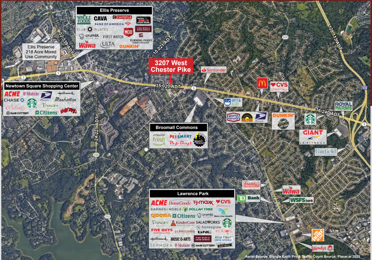
Aerial Source: Google Earth Pro & Traffic Count Source: Placer.ai 2023